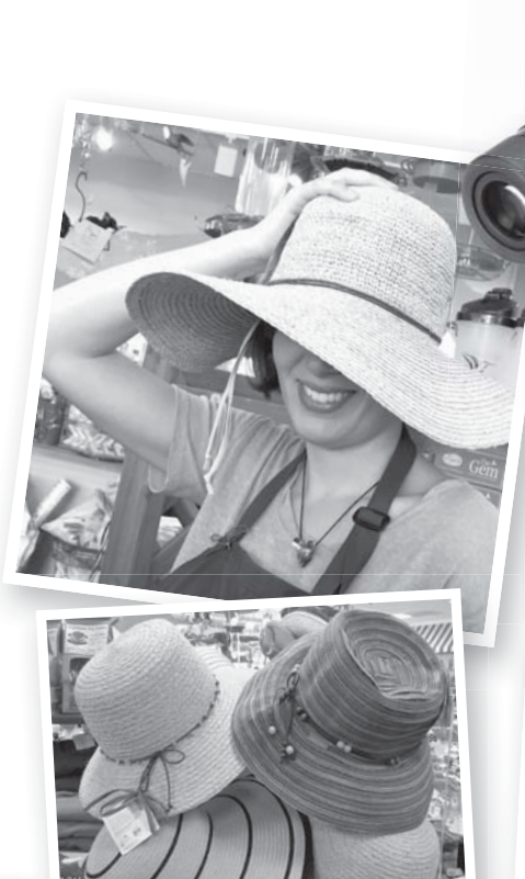
Our beautiful Wallaroo hats keep the sun off your skin