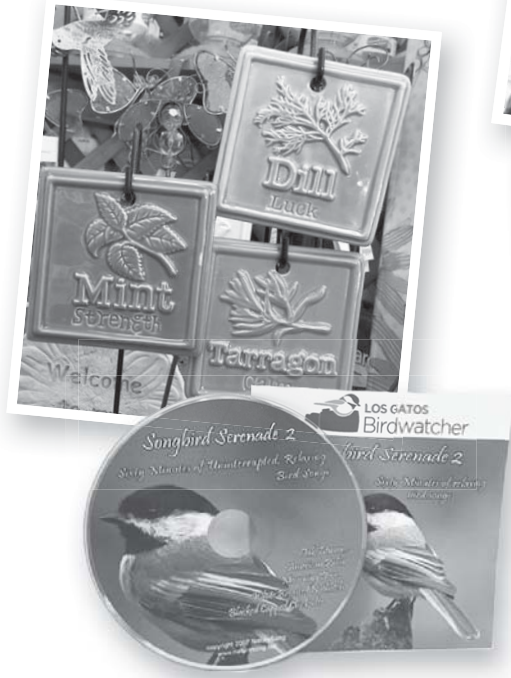
We have a great new selection of relaxing nature CD's