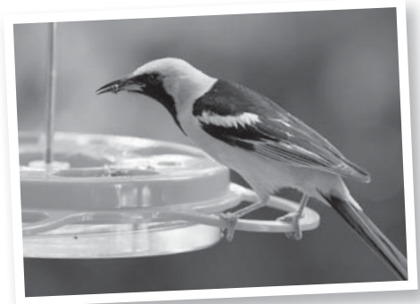
Hooded Oriole on Oriole feeder – Tony Woo

You will notice a change in bird plumages and notice an increase in bird song as males sing to attract a female. There will also be a change in your backyard bird species as many of the species that wintered with you will soon migrate away to their breeding grounds in the north and east. This also means we'll be seeing a return of the birds that wintered elsewhere and will now migrate back to feed and, or nest in your neighborhood.