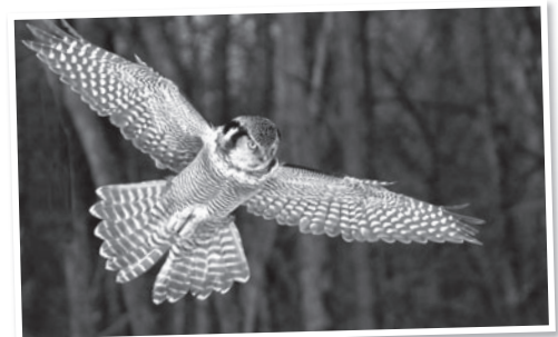
Northern Hawk Owl

We know that many of our customers are talented photographers! Here is your opportunity to share your favorite photo with our birdwatcher community. Enter our twelfth Annual Photo Exhibition to be held on Sunday, August 13 from noon-4:00. We prefer your photo be of a special bird or moment you had in nature. We’d like you to provide information on the location of your photo and the equipment you used – no matter if it was your cell phone or a fancy camera. Call the store to reserve your space. 408-358-9453.