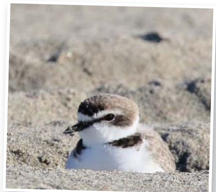
Moss Landing Snowy Plover

On this day, the store will be filled with 30 talented photographers as they share their photos of something they photographed in nature. And if you are a photographer, here is your opportunity to share your favorite photo with our birdwatcher community. It's a fun day as photographers have conversations about camera preferences, lens types, apertures and how they got their shot! Refreshments will be served. We will also have a drawing every hour and a lucky customer will win a photographic card. Photographers, please call the store to reserve your space at 408-358-9453 .