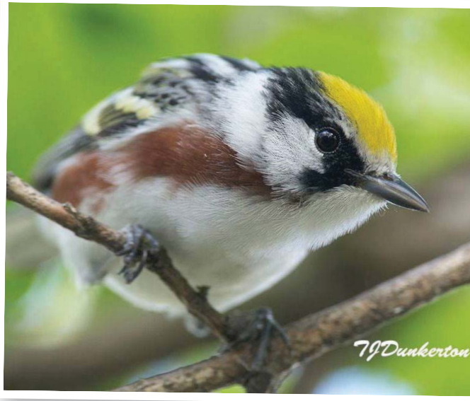
Chestnut Sided Warbler – by Thomas Dunkerton

“Here were the migrants, thousands of small birds, streaming north from the coast of Yucatan- taking off at nightfall for an overwater flight of twelve to eighteen hours, a flight that could eventually take 24 hours if they were slowed by weather over the gulf. Here were the radar stations at Lake Charles and New Orleans, the sweep of the radar detecting