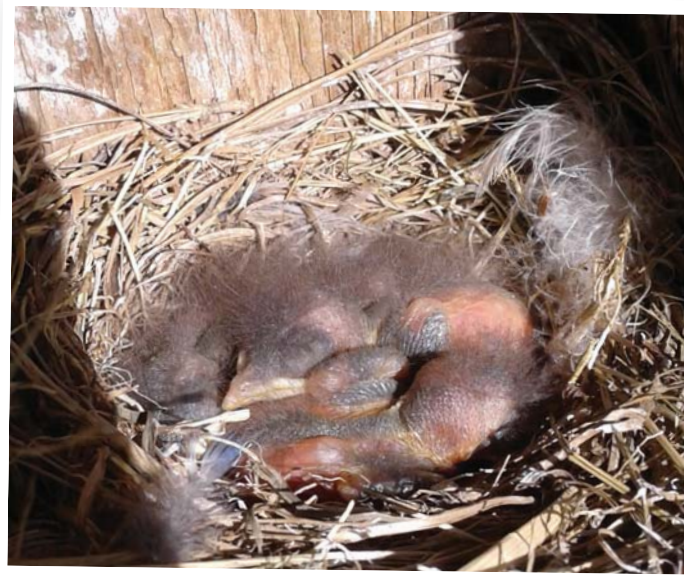
Bluebird chicks inside the nest box