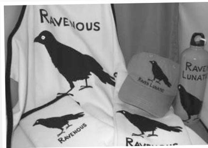
For the B-B-Q'er – Ravenous apron, oven mit, towel, and potholder.