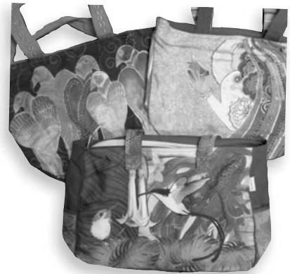
- We have several different styles and sizes of totes and bags