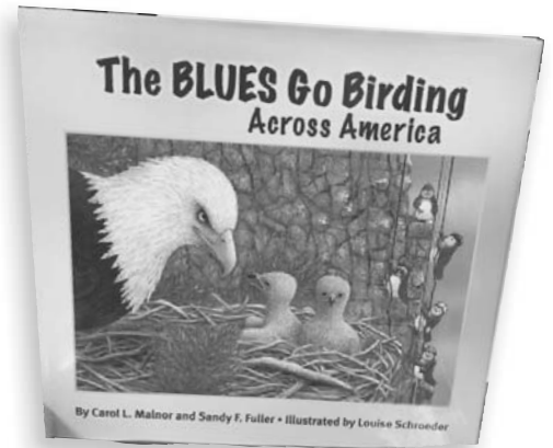
- Several new books from Dawn Publications. All about teaching children about nature