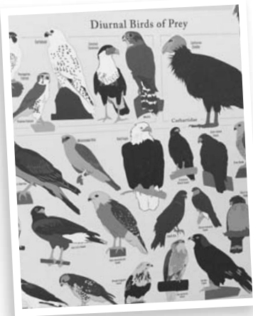
- Birds of North America poster. Beautiful graphic drawings from Pop Chart out of San Francisco