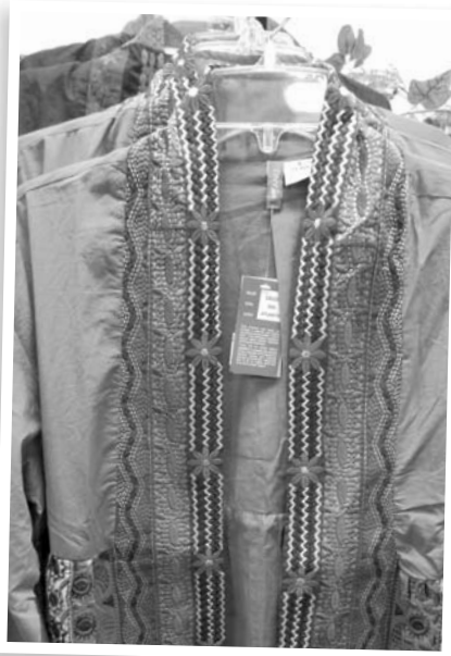
- New spring clothing is arriving