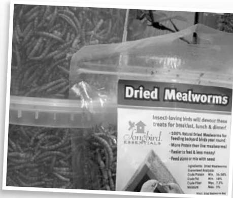
- We've got dried mealworms! For the insect eating birds in your yard