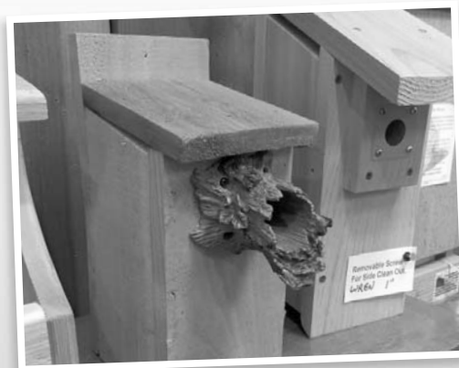
- Its time to put up your nest boxes. We have some that include predator guards.