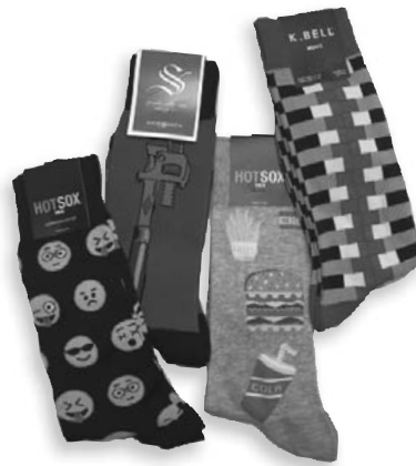
- We continue to increase our men's sock selection