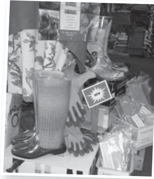
Rain Boots and Gloves – Perfect boots to do your rain dance in!