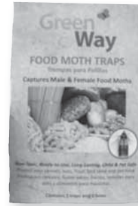
New Moth Trap – These new traps have pheromones for both male and female moths.