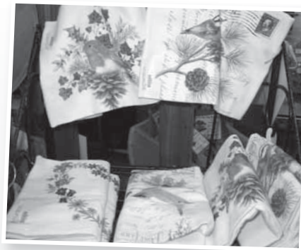
Dish towels – Excellent hostess gifts.