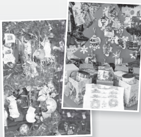
Ornaments – We are fully (and I mean FULLY) stocked with great bird and wildlife ornaments with a few Santas and Snowmen for good measure. We also have lots of Birdseed Houses in many different shapes and sizes.