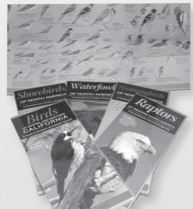
New ID guides – New John Muir Laws fold-out map and Quick Reference Guides with photographs rather than drawings.