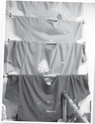
Think Outside T-shirts – Great message, Ladies' and Men's cut, stone wash colors.