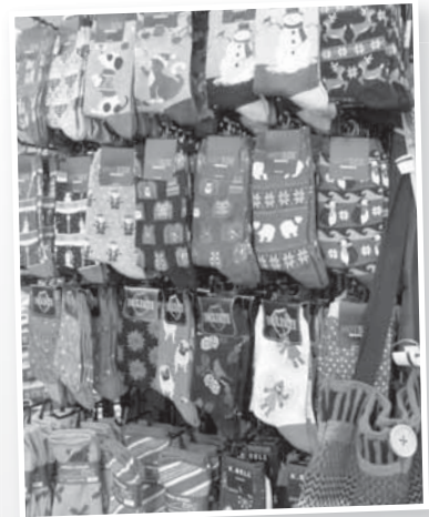
Holiday Socks – They are flying out of the store. My favorite style is the "Snow Angel."