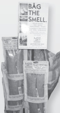
Bamboo Charcoal – New Eco-friendly Odor Absorber in many sizes. I brought this product in for the shoe size for my hiking shoes. Works great.