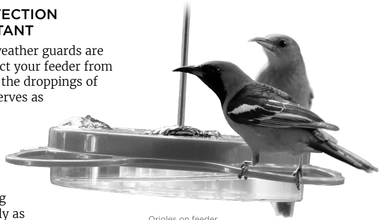
Orioles on feeder.

Unlike hummingbirds, orioles are songbirds. Included in the Icteridae (blackbird) family, there are roughly ten different kinds of orioles in North America. Here in the west we get only two species: the Bullock's and the Hooded. The males of both species are beautifully colored birds with bright yellow, orange and black with white feathers. The females are softer yellow with gray to olive backs. After spending the winter in Central America, they migrate north each spring to nest and raise young. They start to arrive as early as March and are gone by mid-September. Hooded Orioles weave their nests out of plant fibers stripped from the Mexican Fan