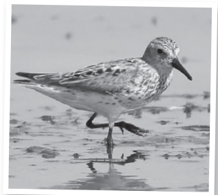
Western Sandpiper