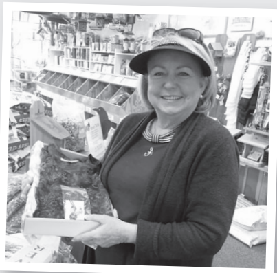
A happy raffle winner!