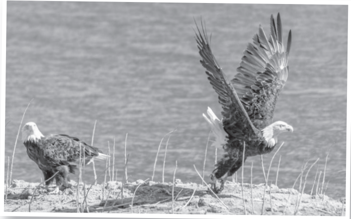
Bald Eagles at Lexington Reservoir