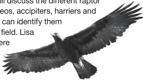
Golden Eagle