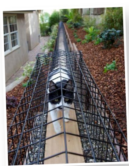
Habitat Haven builds custom cat enclosures

To learn more about Habitat Haven please visit their website habitathaven.com . They will be happy to answer your questions and help you design your own catio.