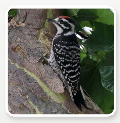
New name ideas: Zebra Woodpecker or Western Woodpecker

Named after English naturalist botanist & zoologist Thomas Nuttall (1786 – 1859)