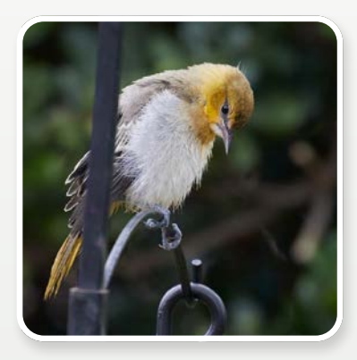
New name ideas: Shy Oriole or Whistling Oriole