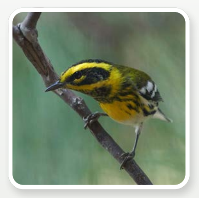
New name ideas: White-bellied Warbler or Streak-flanked Warbler

Named after American naturalist & ornithologist John Kirk Townsend (1809 – 1851)