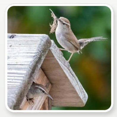
New name ideas: White-browed Wren or Perky Tail Wren

Named after English naturalist Thomas Bewick (1753 – 1828)