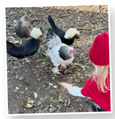
Enjoying backyard chickens

For years customers have been asking us for chicken feed. We always sent them a few blocks north to the experts at "cHICK n bEES." However, cHICK n bEES store owner Melody retired leaving one less place to find food for your chickens.