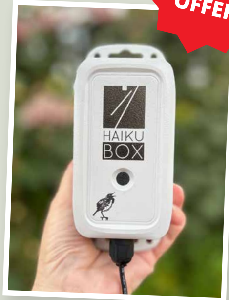
Haikubox Birding Identifier

We are placing a special introductory order for our customers. If you pre-order before Earth Day April 22nd you'll receive