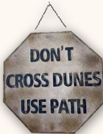
Beach design garden wall art