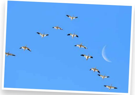
Snow Geese and moon – Tony Woo

Spring migration is here! Some of the species that wintered in California are leaving for breeding grounds in the north, while other species are just now returning and will stay until the fall. Millions of ducks, geese, and swans (waterfowl) have spent the winter in and around the Bay Area. They are now on their migration north to be timed with the melting of snow and ice. You may see evidence of waterfowl migration if you look to the sky and see “V” formations.