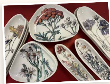
Serving dishes with a colorful flower theme