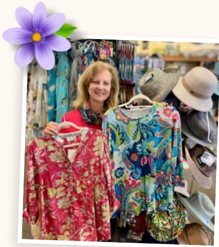
Brighten up your spring wardrobe

Choose from a huge selection of season inspired gift items