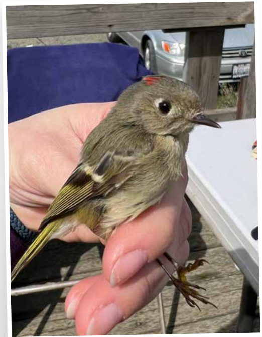
Banding a Ruby-crowned Kinglet

If we are lucky, we'll be able to release a bird! Spaces will fill fast so call soon to reserve your spot. Details will be provided after you register. A portion of this morning's proceeds will go back to SFBBO.