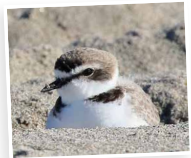
Snowy Plover – Tony Woo

Open to all levels these free workshops help customers learn how to identify four different species of birds found in the Bay Area per season. Workshops will take place at the Los Gatos Birdwatcher outside in our back parking lot from 5:30 – 6:30 PM. We'll go over each species and review behaviors, food and habitat preferences plus vocalizations.