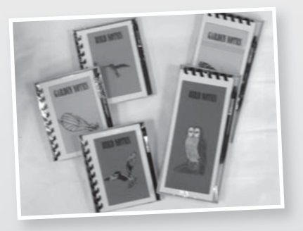
Bird Note Journals – with pen - small and tall

New cards –Bright and cheerful, just the right card to send to a friend