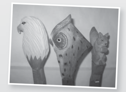
Hiking Sticks – Hike in style

New Glass hummingbird feeder – Simple and stylish