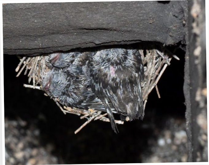
3 Vaux's Swift chicks in the nest