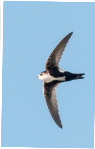
White throated Swift – Fred Lim

Swifts are built for fast, agile flight and have tiny feet that disappear up against their body. It makes for an ideal aerodynamic physique. Their feet are so small that they cannot perch like other birds, however, this body structure is ideal for clinging, and is why they have adapted to nesting and roosting on vertical surfaces. Swifts are in the family “Apodidae” which means “without feet”.