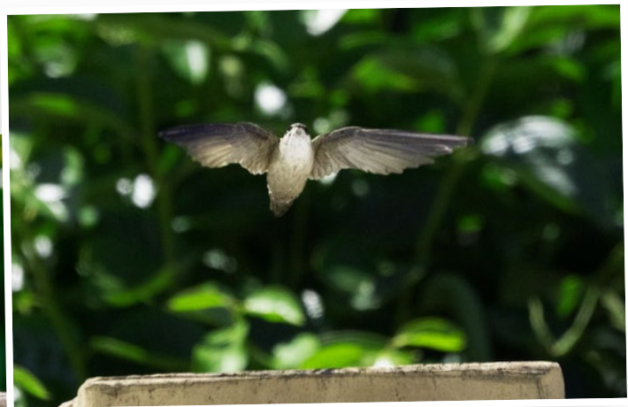
Parent Swift coming out of chimney – Rick Row