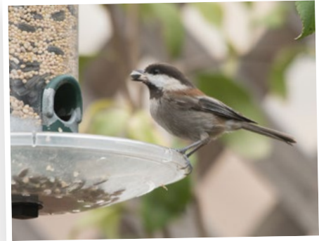
Chestnut-backed Chickadee at feeder – Ron Machado

Visit for details - feederwatch.org/welcome-to-feederwatch