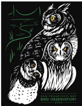
SFBBO T-shirt Graphic

"The San Francisco Bay Bird Observatory (SFBBO) is a nonprofit with the mission to promote sustainability in the Bay Area and beyond by engaging communities in avian research, habitat restoration, and education. Each year they raise money for their programs through the California Fall Challenge (CFC) and the Los Gatos Birdwatcher wants to help them reach their goals. Donations of $80 or more are eligible to receive SFBBO's 2023 CFC T-Shirt (pictured) which showcases a Great Horned, Short-eared, and Burrowing Owl ( the estimated value of the black shirt, $15, is not tax deductible ).