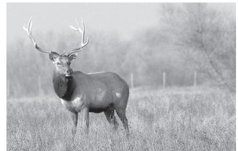
Tule Elk