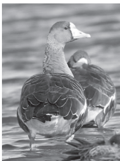
Greater White Fronted Goose