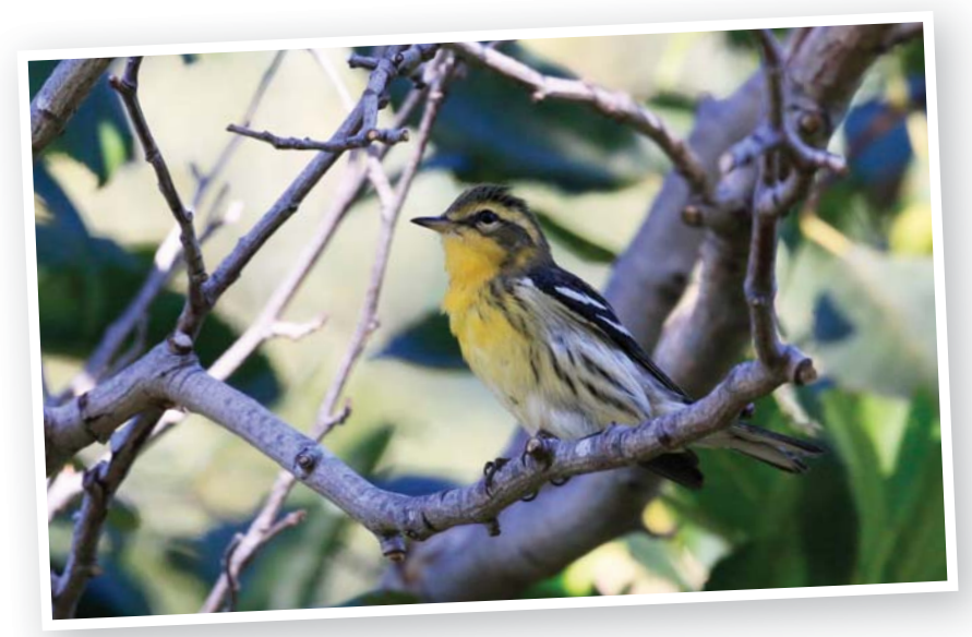
Vasona Blackburnian Warbler

These birds are considered rare or "vagrant." Often they are young birds that were born the past Spring. As they leave the area where they were born and start their instinctual migration south, they get