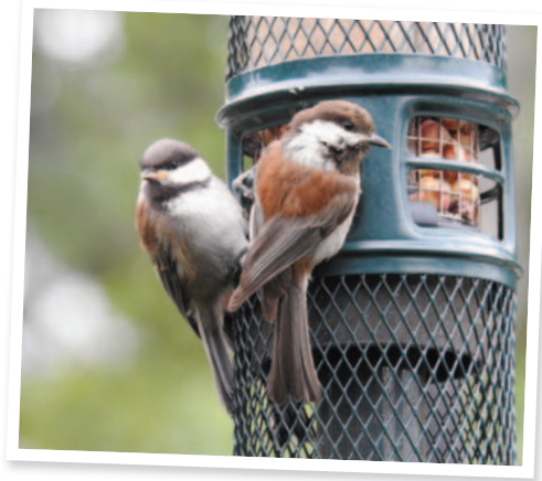
Chestnut-backed Chickadees at feeder

Project FeederWatch is a joint project of the Cornell Lab of Ornithology and Bird Studies Canada. It's a fun way to learn about your backyard birds and contribute to a 30+ year-and-running data-set of bird population changes. With FeederWatch, you become a scientist in your own backyard and your counts become part of something bigger. You can count birds as often as every week, or as infrequently as you like: the schedule is completely flexible. All you need is a bird feeder, bird bath, or plantings that attract birds. Visit their website to learn more. https://feederwatch.org