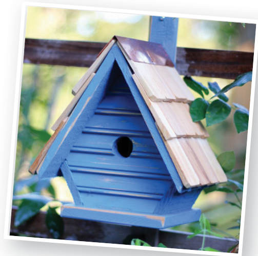
Gift a Bird House