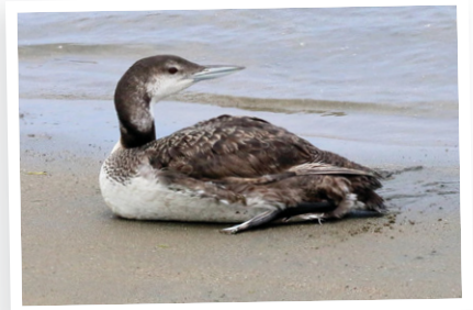
Pacific Loon