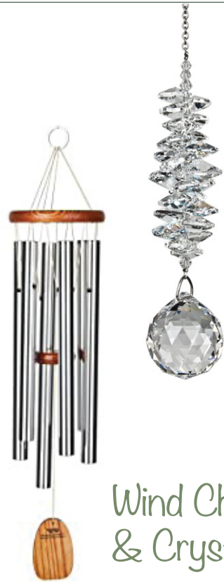
Wind Chimes & Crystals

Come Check out Our Holiday Card Selection