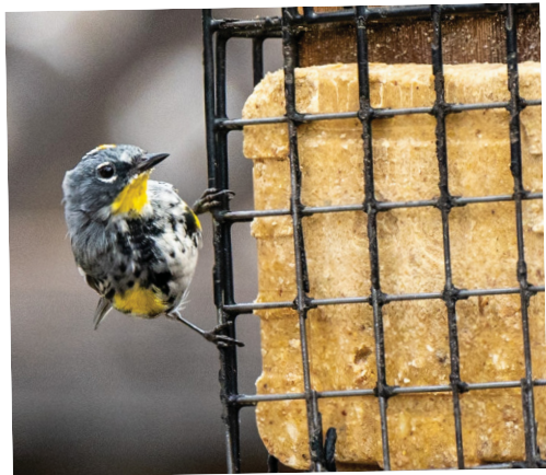
Yellow-rumped Warbler at suet feeder

Project FeederWatch is a joint project of the Cornell Lab of Ornithology and Bird Studies Canada. It's a fun way to learn about your backyard birds and contribute to a 30+ year-and-running data-set of bird population changes. Project FeederWatch turns your love of feeding birds into scientific discoveries.