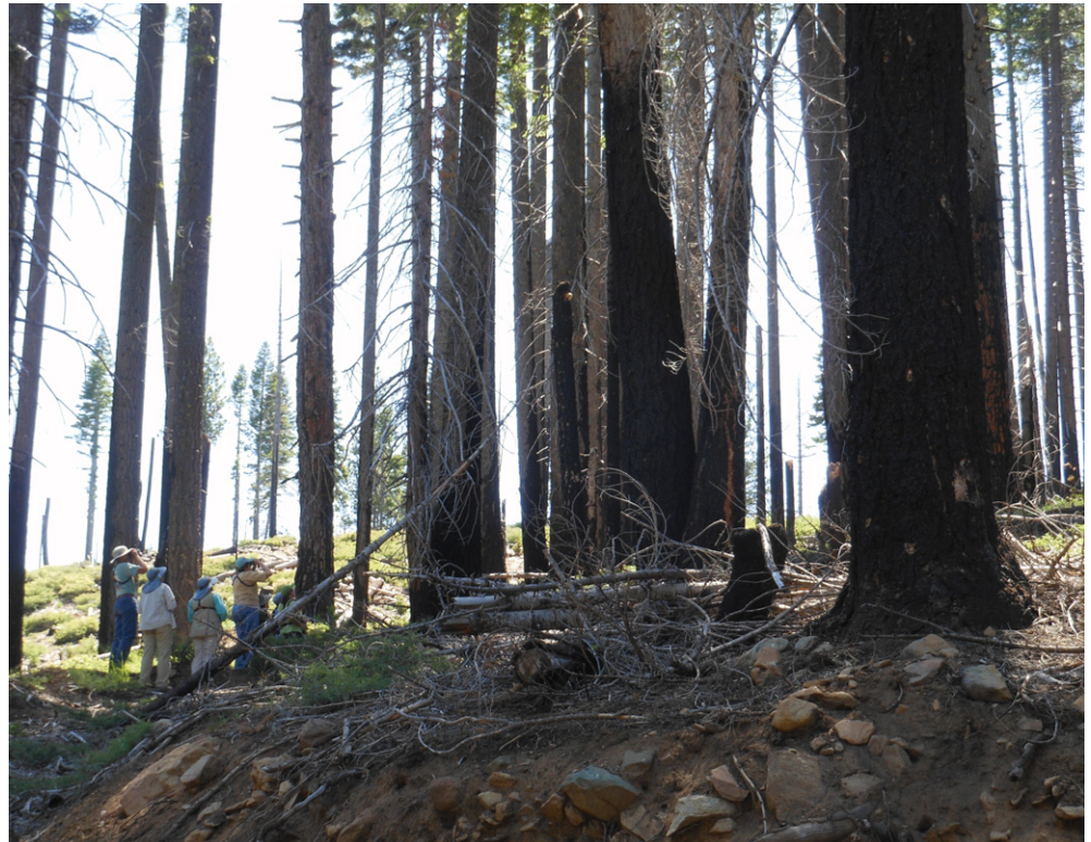
Let's Go Birding 2013 tour in the Sierras. At the sight of an old forest burn, participants look for Black- backed Woodpeckers.

Fire is a natural part of almost every California ecosystem and is important to its health. But the intense, frequent fires that California has seen in recent years are not normal, and sometimes not