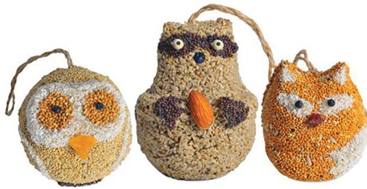
Gifts Made Out of Bird Seed

Come Check out Our Holiday Card Selection