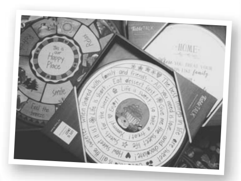
Beautiful Lazy Susan's come in different sizes