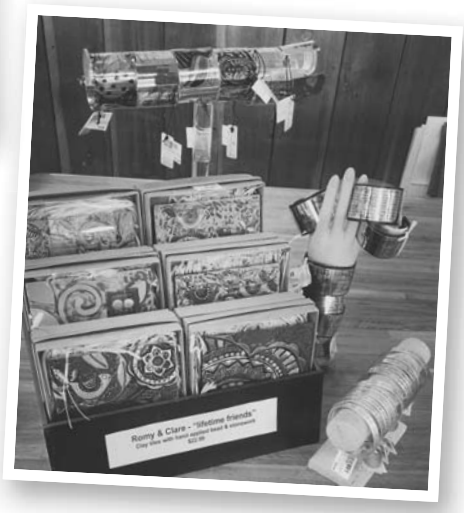
We have new jewelry & wall tiles