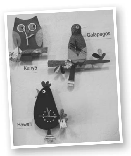
Colorful & fun wall clocks