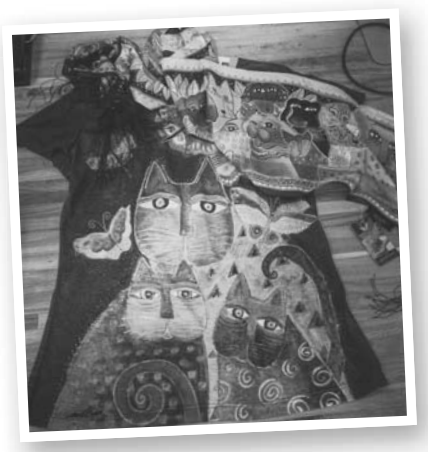
Laurel Burch is as popular as ever!