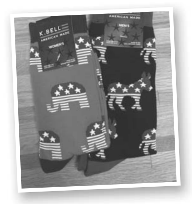
Socks for election time