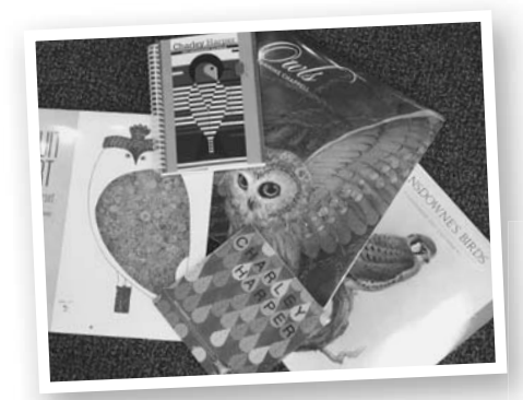
2017 Calendars are here