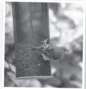
Lesser Goldfinch at thistle feeder

When it comes to goldfinch, some of you experience flocks of goldfinch coming to your thistle feeders, while others are finding few. We do not totally understand why this happens, but it's a common experience with goldfinch. What we do know is that both Lesser and American Goldfinch are species that hang out in flocks mainly during the winter. When Spring comes along the birds will go off into pairs as they prepare for the nesting season. This means things will change at your feeders. As the birds pair off they will find available food in the areas near their nests, thus eliminating the need for the food you are supplementing. During this time you may only find a few birds or none at all. Usually this is only temporary with the season. If you have noticed fewer goldfinch coming to your thistle feeders, we suggest you put less thistle into your feeder. That way you are providing food for those that do visit your feeder, while not having too much sitting there with the potential to dry out. You can also try our "Finch Blend" mix which combines thistle and sunflower chips. This mix fits in all thistle feeders and is also appealing to chickadees and titmice.