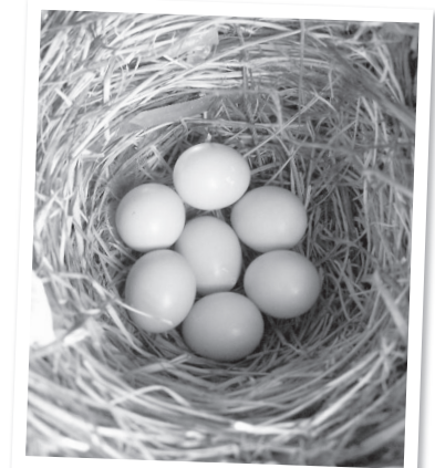
Bluebird eggs in nest box