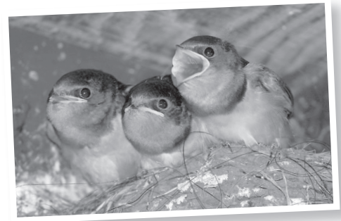
Baby Barn Swallows – Tom Grey

Many of you have been enjoying the nesting activities happening in your yard. You have watched your yard birds building their nests, incubating eggs and feeding young. You have protected them from predators and made sure there was fresh food and water near. Parent birds love suet and will come to your feeders frequently as a quick way to get the food they need to feed their growing young. This means re-filling feeders more often than normal, and many of you have said, “they are eating me out of house & home!” Not to worry, pretty soon the action will quiet down.