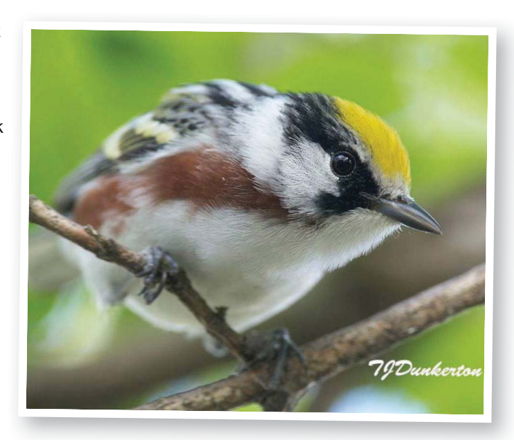
Chestnut Sided Warbler - by Thomas Dunkerton

This last Spring I took time out to visit Ohio and experience the birding festival known as the, "Biggest Week In American Birding." The festival is located along the southern coast of Lake Erie and coincides with the Spring migration as millions of birds return to North America after wintering in Mexico, Central and South America. The event is packed full with speakers, workshops, walks and tours and