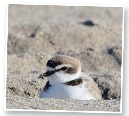
Moss Landing Snowy Plover

On this day, the store will be filled with 30 talented photographers as they share their photos of something they photographed in nature. And if you are a photographer, here is your opportunity to share your favorite photo with our birdwatcher community. It's a fun day as photographers have conversations about camera preferences, lens types, apertures and how they got their shot! Refreshments will be served. We will also have a drawing every hour and a lucky customer will win a photographic card. Photographers, please call the store to reserve your space at 408-358-9453 .