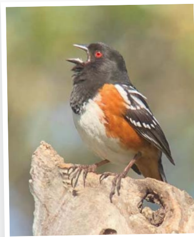
Spotted Towhee singing - Jean Fordis