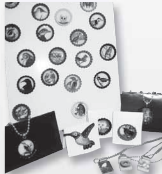
Jewelry – Scrabble pieces with decoupage bird images, bottle cap pins and necklaces with vintage bird images, and colorful beaded animal and bird pins. Nicely priced.