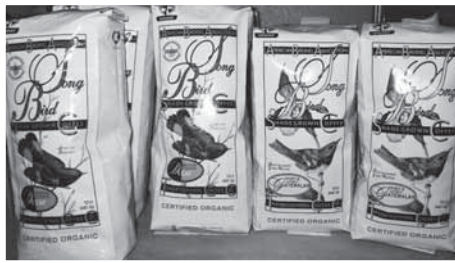
New Coffee – American Birding Association’s Thanksgiving Songbird Coffee. Support a great birding organization and the birds that benefit from shade-grown coffee.