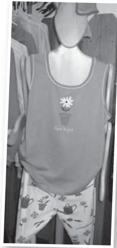
Hatley Fashions – Garden PJ bottoms with “Gone to Pot” tank top and birdie capri & tank sleep set.