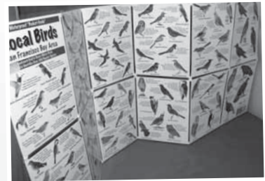
Local Bird Chart – Our wonderful bird ID “Cheat Sheet” is expanded to 200 birds and they are a bit bigger too.