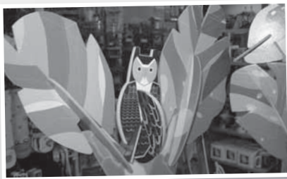
3-D Tree and Birds Puzzle by Hip from Holland – I’m a sucker for birds and puzzles. This combines them and makes an interesting “objet d’art” for every bird lover, no matter the age. The best part is that you can change the birds and leaves around!