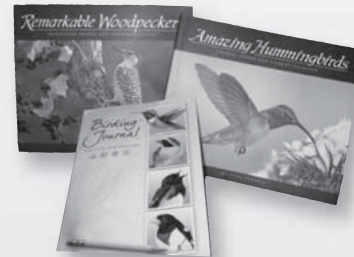
New Books – Adventure Publishers has several new magnificent books available. Also children’s books.