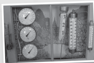
Weather Instruments from Conant Custom Brass and Weeks & Plath – We are reintroducing these lovely brass/copper/stainless steel thermometers, rain gauges and weather stations. Also in travel sizes.