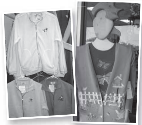
Cardigans – Zipper, Pockets, Bird Embroidery (hummer, chickadee, and goldfinch). Easter sweater and vest.