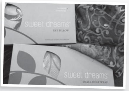
SWEET DREAMS – Eye Pillows & Heat Wraps are a wonderful gift to yourself or someone special