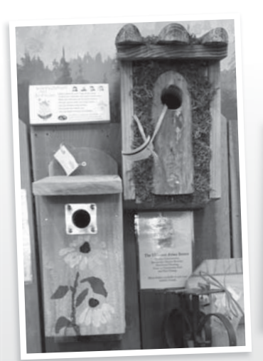
NEST BOXES - Now's the time to put up your nest boxes