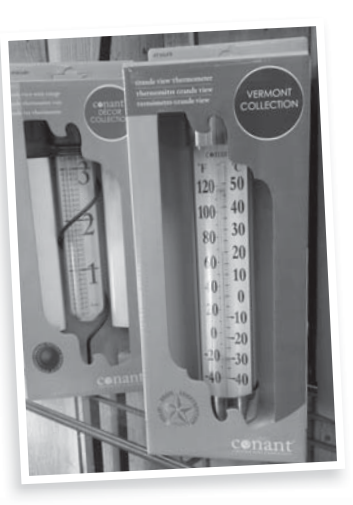
RAIN GAUGES - Rain Gauges are popular again and we have several styles

WALL HANGERS - Wall hangings are a great way to add beauty to your home or harden