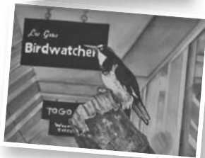
Art by: Kris Crane