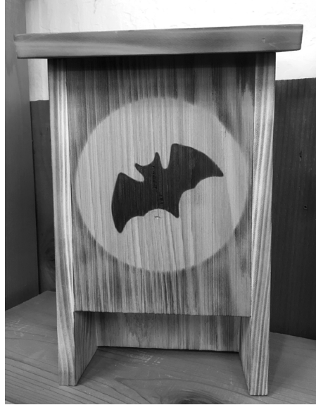
Attracting Bats to Roost: If bats are known to be in your area, they are more likely to inhabit your bat house.

the bottom for bats to enter and rough surfaces inside for them to cling to.