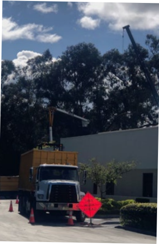
The arborist high up in these Eucalyptus Trees caught the attention of many

At the end of April, a customer who is also a birder observed a professional arborist in the early process of removing a row of huge eucalyptus trees that border Vasona County Park off University Ave. This tree removal activity was a concern because Great-horned Owls are known to nest in this location. In fact, birders have been observing these owls for years. The pair had successfully raised two owlets in 2022 and one owlet in 2023. Besides the owls, several other