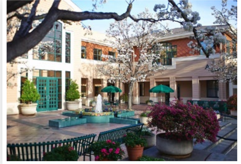
Front entrance to The Terraces