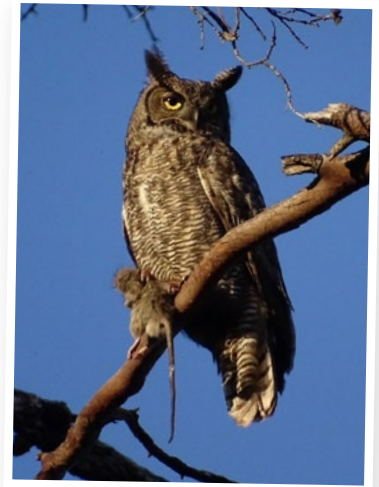
Adult Great-horned Owl bringing a mouse back to the nest

removed in the middle of the breeding season. The arborist stopped cutting as soon as they were aware there were nesting owls. Our local Santa Clara Valley Audubon Society sent out volunteers to better understand why the trees were being removed during the breeding season and conversations with the Santa Clara County Park service also took place.