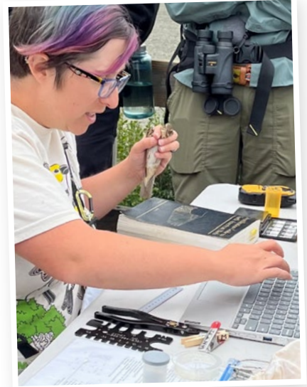
SFBBO bander recording data of a Swainson's Thrush

What exactly is bird banding? Bird banding is a way scientists can identify and track birds. Bird banding stations are strategically located all over the world. At a banding station, mist nets are set up in areas the researchers have determined are favored flight paths used by the birds. At CCFS the nets are placed along Coyote Creek where there is a lot of songbird activity. The mist nets are placed just before sunrise with the goal of having birds fly into the nets. These specially made mist-nets do not harm the birds but do keep them from being able to escape. The nets are checked frequently throughout the morning, about every 30 minutes. Trained volunteers safely extract the birds from the nets, and carefully place them in small cloth bags. The cloth bags allow for less handling, provide shelter, and help the birds from getting too stressed. They are then taken to the next person known as the bird bander. This person confirms the species and is trained to gather specific information about the bird like its weight, wing length, breeding information, plumage condition, if it is a male or a female, etc. Banders then refer to a reference guide that tells them what size band should be used on which species.