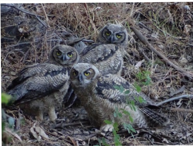
Well camouflaged, most will walk right past these three owlets and never see them

After the nesting season comes to an end and the young owlets leave the area to find their own territory, the trees are forecast to come down. Vasona County