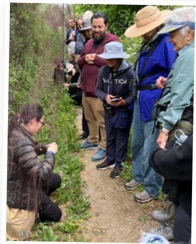
Participants watch as SFBBO volunteers remove a bird from the mist-nets

If you are ever interested in banding or want to volunteer you can apply at SFBBO, or look into the other area banding stations, one is in Santa Cruz, as well as Point Blue up north in Point Reyes. The most active times for banding are usually during spring and fall migration but seeing different types of birds at every point of the year is a lot of fun. If you ever have the opportunity to check out a station, please do!