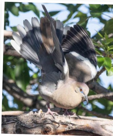
White-winged Dove

Please bring your own folding chair and field guide with you. Limited to 30 people. Call to reserve your spot 408-358-9453 .