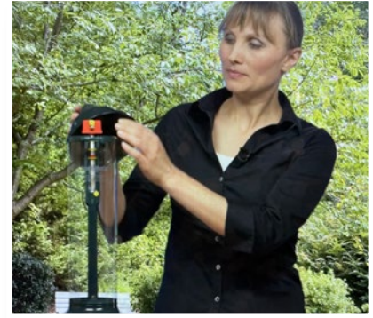
Squirrel Buster cleaning tutorials are available to watch on YouTube

As birds gather close together at feeders one sick bird can make other birds sick too. To help prevent the spread of disease it is important to clean bird feeders regularly. For years the Los Gatos Birdwatcher has helped our bird-feeding community by cleaning your bird feeders, but at the end of the summer, we will no longer be able to provide this free service. We know this will disappoint those who bring their dirty feeders into the store to be cleaned, but we will be happy to show you how to clean your own feeders. Simply call the store at 408-358-9453 to make an appointment. We'll spend time to show you how to take your feeder apart and put it back together.