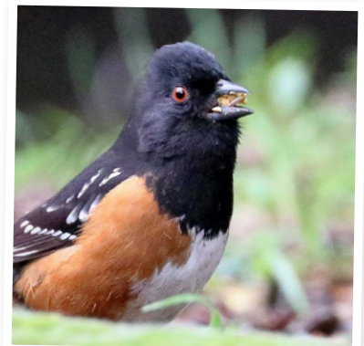
Spotted Towhee

Customers have asked if they should take down their feeders this time of year. Will feeding the birds keep the birds from migrating? The answer is "No". Some of the species in your yard like towhees, Bewick's Wrens, and Chestnut-backed Chickadees are "resident" which means they live here all year long, so they will continue to enjoy the seed you offer. The species that migrate like Black-headed Grosbeak, White-Crowned and Golden-Crown Sparrows do so out of instinct. The need to migrate is great and influenced by length of day, outside temperatures and hormones. So they will leave regardless of your feeders.