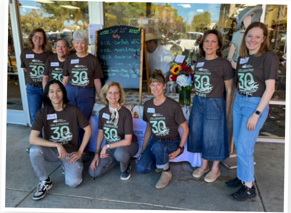
The Los Gatos Birdwatcher Team