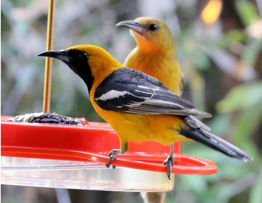
Hooded Oriole pair at oriole feeder –Tony Woo