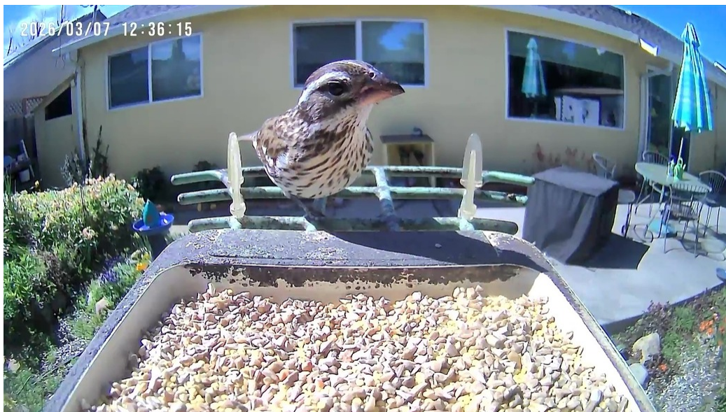
Rose-breasted Grosbeak

Returning from Mexico, customers reported the season's first oriole sightings during the second week of March. Now is a good time to put out oriole feeders with fresh sugar water, and avoid tree trimming until late summer.