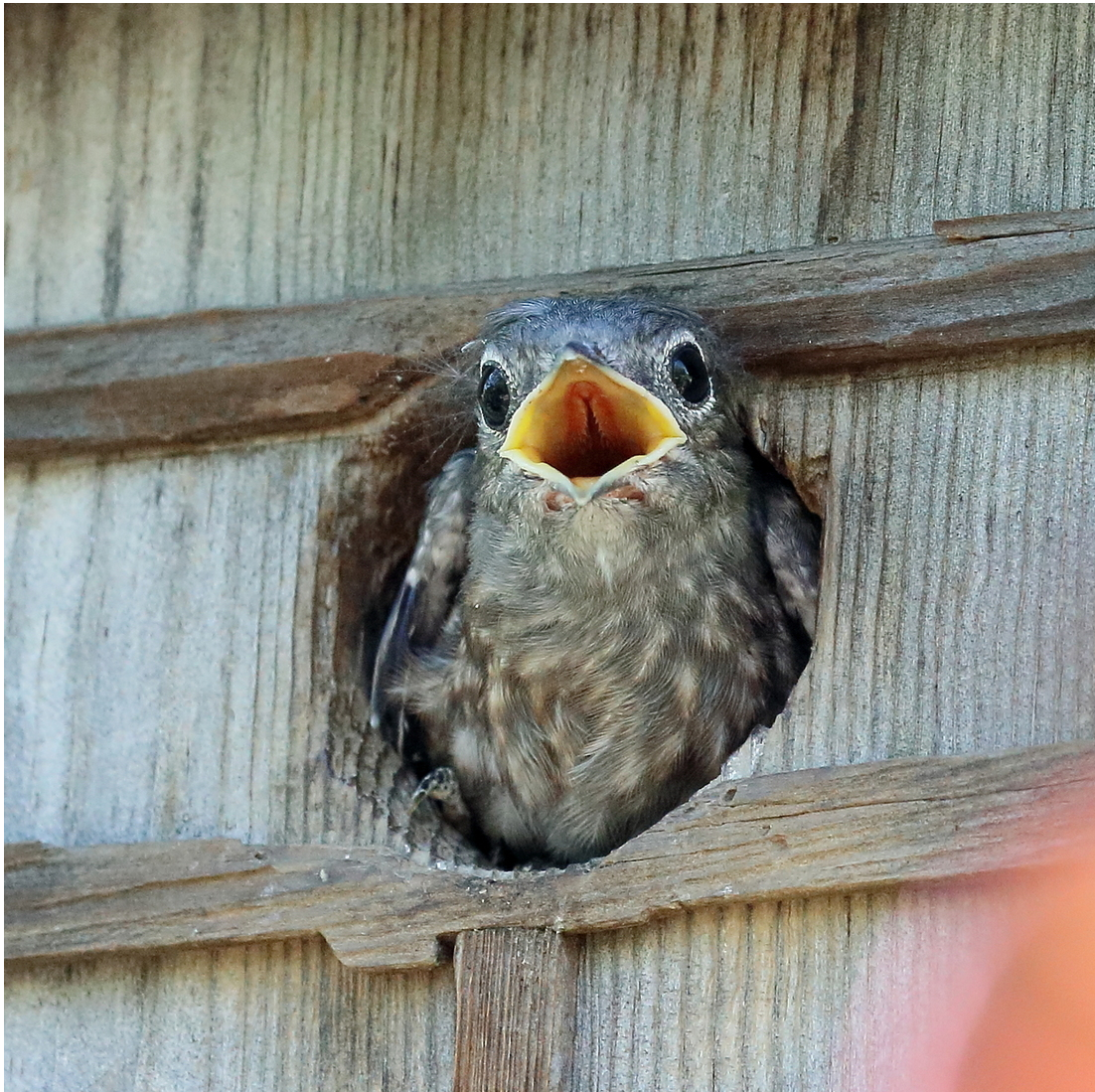
Western Bluebird chick in bluebird nesting box

Mon–Sat 10AM–5PM • Tues 10AM–7PM • Closed Sundays