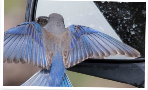
Western Bluebird

Spring is the time of year when customers start asking about the birds they hear tapping at their house windows. We explain this happens during the breeding season when the bird's hormones begin to rise. Birds become very territorial and glass is difficult for birds to comprehend. They interpret their reflection as an intruder to their mating territory and do not understand it is themselves they are seeing. Sometimes they cannot see the glass and they fly directly into it. When it comes to tapping, they are seeing their own reflection. Birds are observed attacking their reflection in anything reflective including metal or even a car's rear-view mirror.