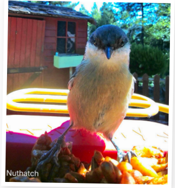
Pygmy Nuthatch at Smart Feeder