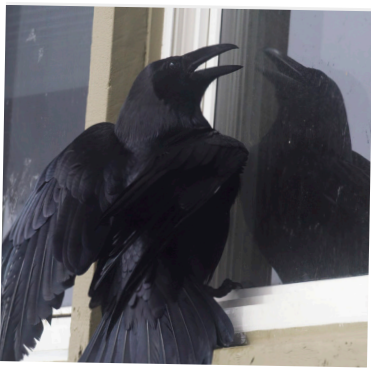
Raven – Fred Lim

In the past, it was thought that a bird tapping at your window was a sign of imminent death in the household and the bird would guide your soul to the afterlife. We know better now.