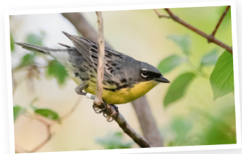
Rare Kirtland's Warbler